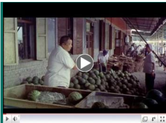
Forks Over Knives Trailer

A film that examines food as medicine and how a whole food, plant-based diet may prevent many of the degenerative disease plaguing humans today. "A film that will save your life." Roger Ebert (96 min.)