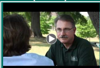
Tap Out Trailer