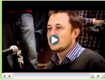
Revenge of the Electric Car Trailer

2012 Tri-County Lawn Mower Exchange Saturday, March 24th 10 a.m.- 1 p.m. Mount Pleasant Waterfront Park