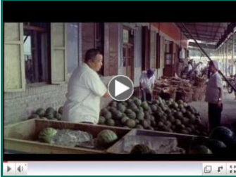
Forks Over Knives Trailer

A film that examines food as medicine and how a whole food, plant-based diet may prevent many of the degenerative disease plaguing humans today. "A film that will save your life." Roger Ebert (96 min.)