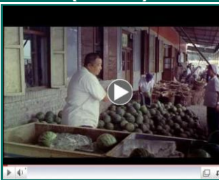
Forks Over Knives

"A film that will save your life." Roger Ebert (96 min.)