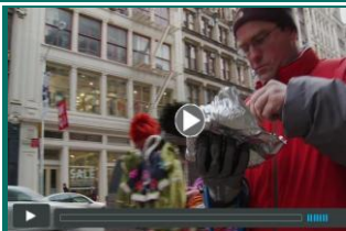
Bag It Trailer

An award-winning film that investigates the effect of plastics on waterways, oceans, their inhabitants and also the veritable human body. (78min.)