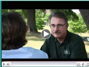
Tap Out Trailer